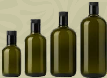
Biolio Series 250-500-750-1000 ml