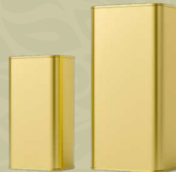
Tin Can 0,5L- 1L- 2L- 3L 4L- 5L- 10L- 18L