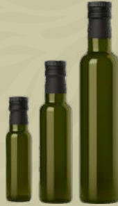
Dorica Series 250-500-750 ml