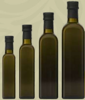
Maraska Series 250-500-750-1000 ml