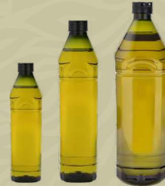
250-500-750-1000 ml 2000-3000-5000 ml