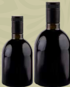
Kolio Series 500 ml