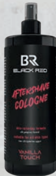
VANILLA TOUCH Soft Warmth / Smooth Post-Shave Feel