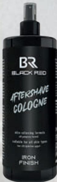
IRON FINISH Bold Control / Refined Finish