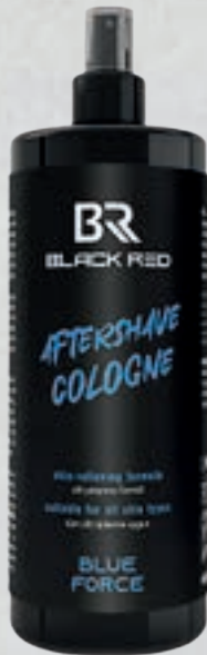
BLUE FORCE Fresh Power / Clean Finish

Designed to refresh the skin after shaving while leaving a clean and distinctive fragrance impression, Black Red Aftershave Cologne Series combines post-shave comfort with expressive scent directions created for modern grooming routines.