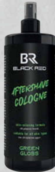
GREEN GLOSS Vibrant Freshness / Daily Comfort