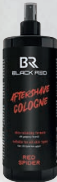
RED SPIDER Energetic Character / Lasting Freshness