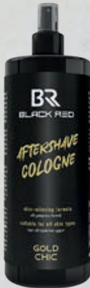
GOLD CHIC Warm Signature / Smooth Comfort