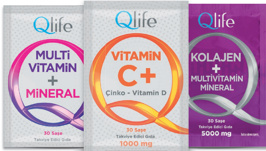
Food Supplements as Sachet Form