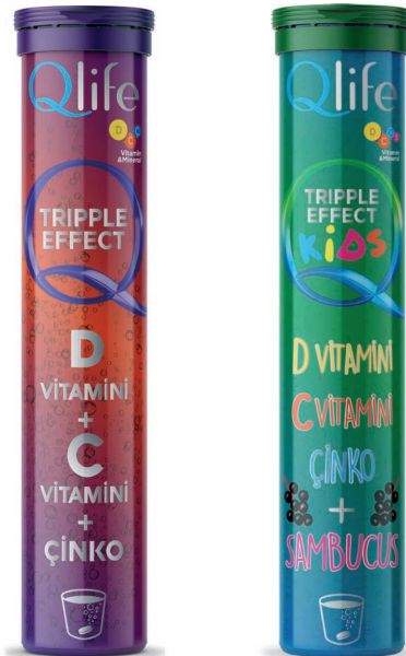
Food Supplements as Effervescent Tablet.