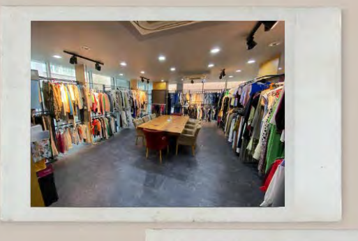
Fashion & Licence Our Showroom