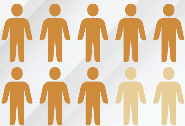
Schema 1.0 : 8 out of 10 people preferred Global City again after their first order