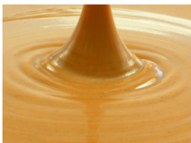
Light Hazelnut Paste Light Roasted