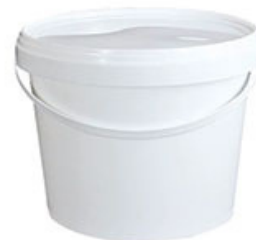
PLASTIC BUCKET 10 kg