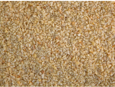
Roasted Hazelnuts Diced 2-4 / 4-6 / 6-8 mm