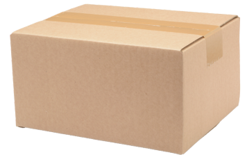
VAC. BAG IN CARTON 10 - 25 kg