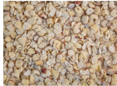
Natural Hazelnuts Sliced 0.8 / 1 / 1.2 / 1.4 / 1.6 / 1.8 / 2 mm