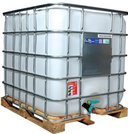
IBC TANK 1000 kg