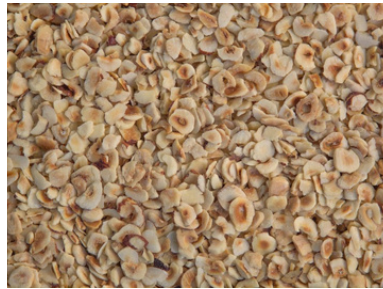
Roasted Hazelnuts Sliced 0.8 / 1 / 1.2 / 1.4 / 1.6 / 1.8 / 2 mm