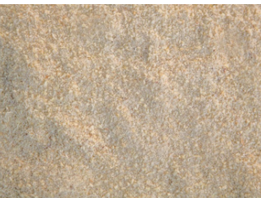
Roasted Hazelnut Meal 0-2 mm