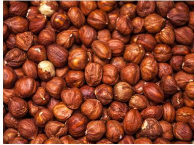
Natural (Raw) Hazelnuts 9-11 / 11-13 / 13-15 mm