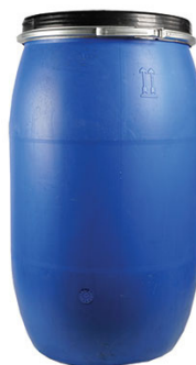
PLASTIC DRUM 30- 60 kg