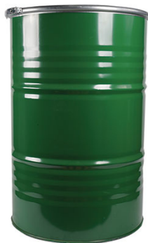
METAL DRUM 200 kg