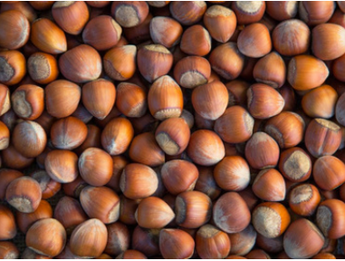
In-Shell Hazelnuts 17 mm+

See our full product list at our website www.batafood.com