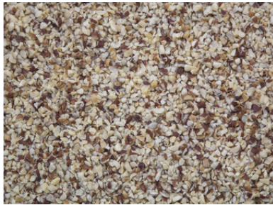
Natural Hazelnuts Diced 2-4 / 4-6 / 6-8 mm