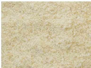
Blanched Hazelnut Meal 0-2 mm