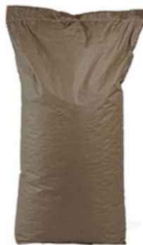
PAPER BAG 20 - 25 kg