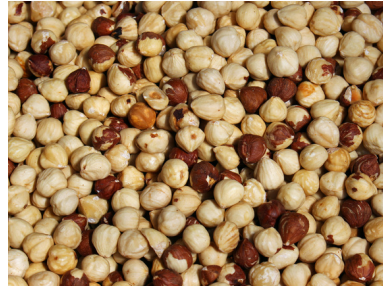
Roasted Hazelnuts 11-13 / 13-15 mm