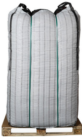
BIG BAG 1000 kg

Bata Food's hazelnut products are available in various packaging options from paper bags to IBC tanks. Our standard and most popular packaging types are 25 kg vacuum bag in carton for Hazelnut Kernels and 30 kg plastic drum for Hazelnut Paste products.