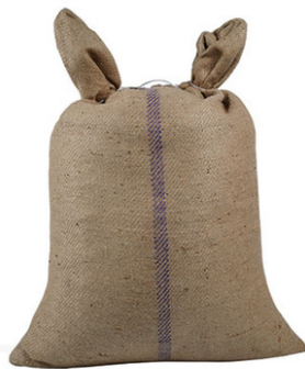
JUTE BAG 50 - 80 kg