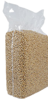
VACUUM BAG 10 - 25 kg