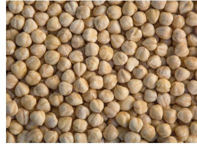
Blanched Hazelnuts 11-13 / 13-15 mm