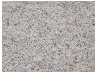
Natural Hazelnut Meal 0-2 mm